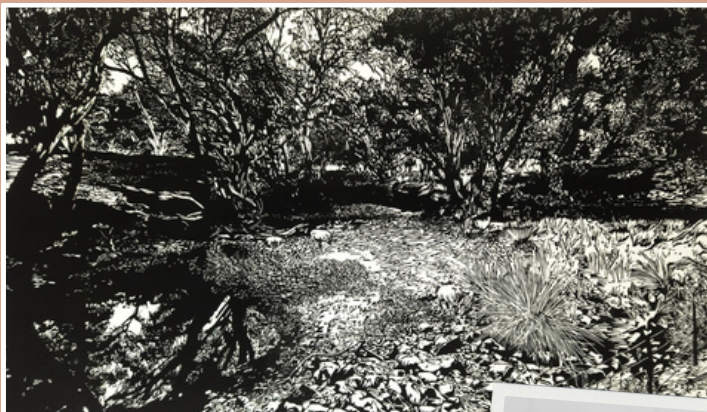
Grazing the creek bed - Milburn Art Prize entry